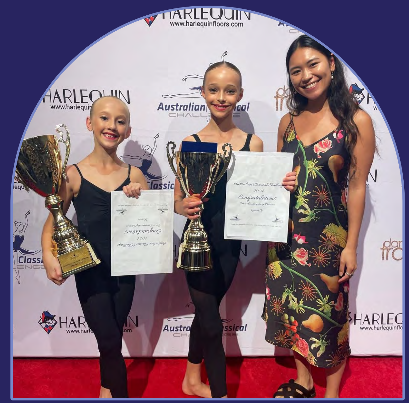
JUNIOR CONTEMPORARY DIVISION WINNERS 2024