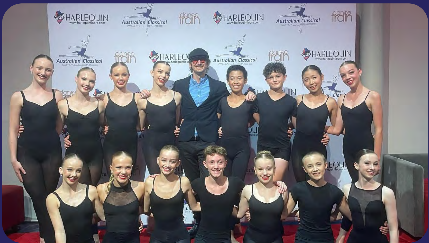
2024 INTERMEDIATE CONTEMPORARY FINALISTS