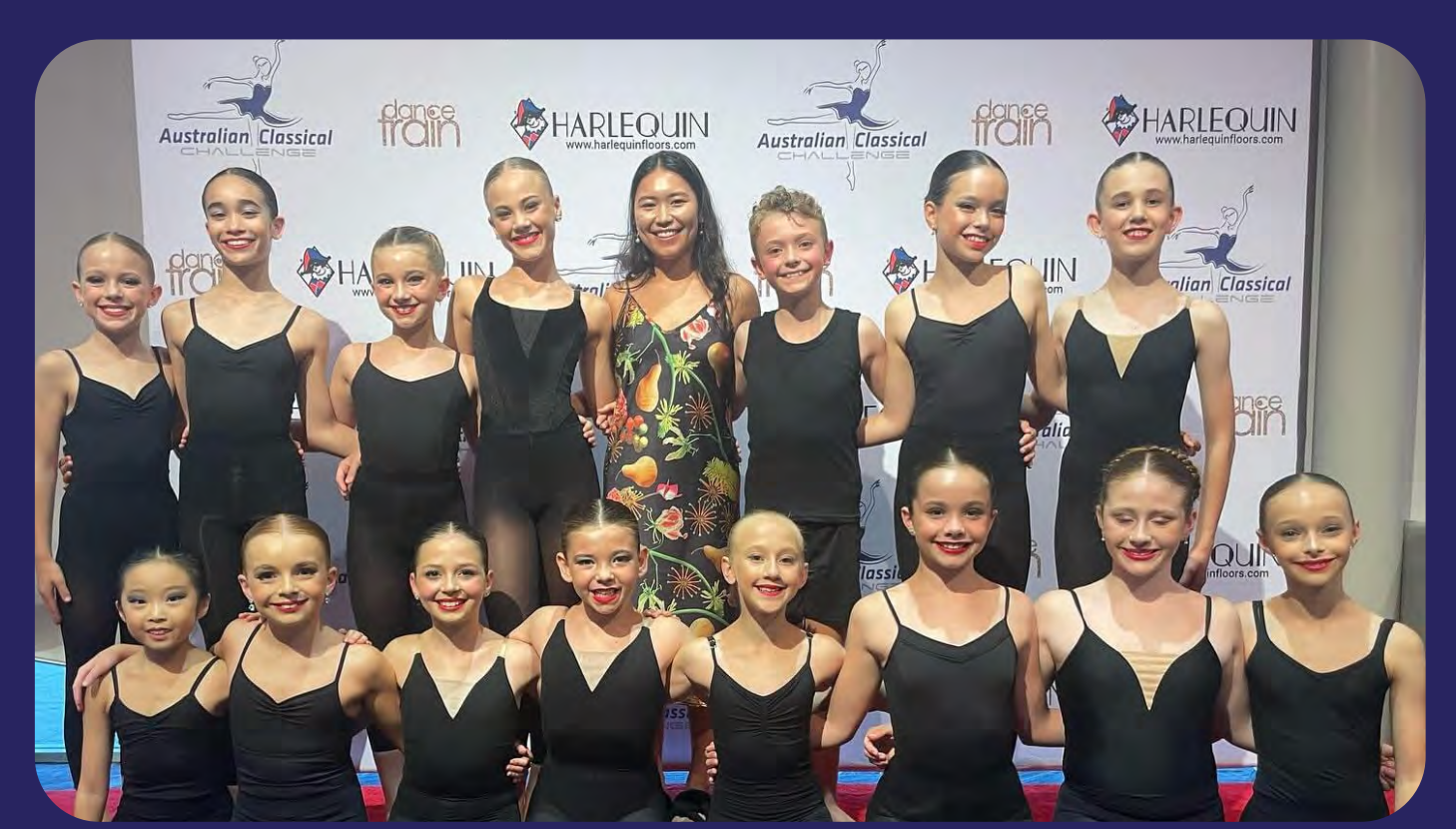
2024 JUNIOR CONTEMPORARY FINALISTS