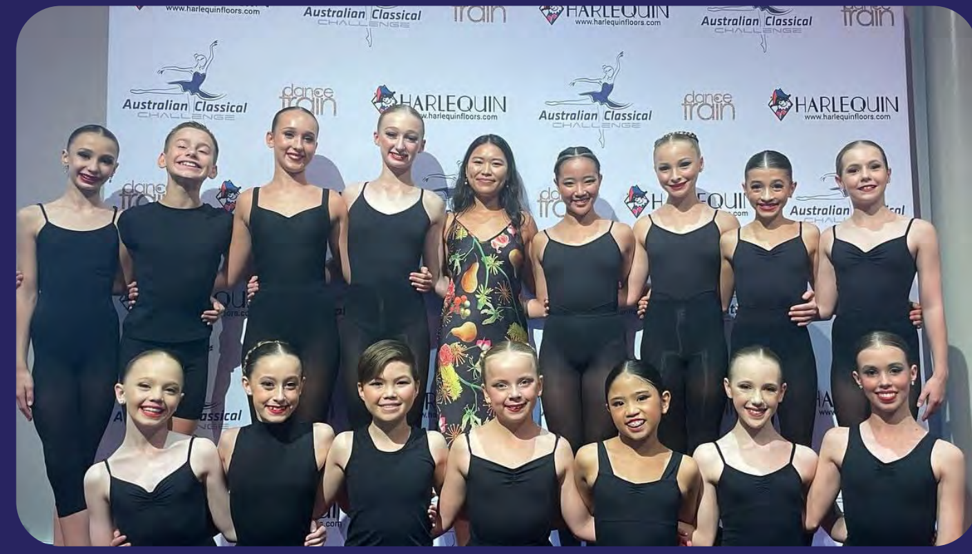
2024 PRE-INTERMEDIATE CONTEMPORARY FINALISTS