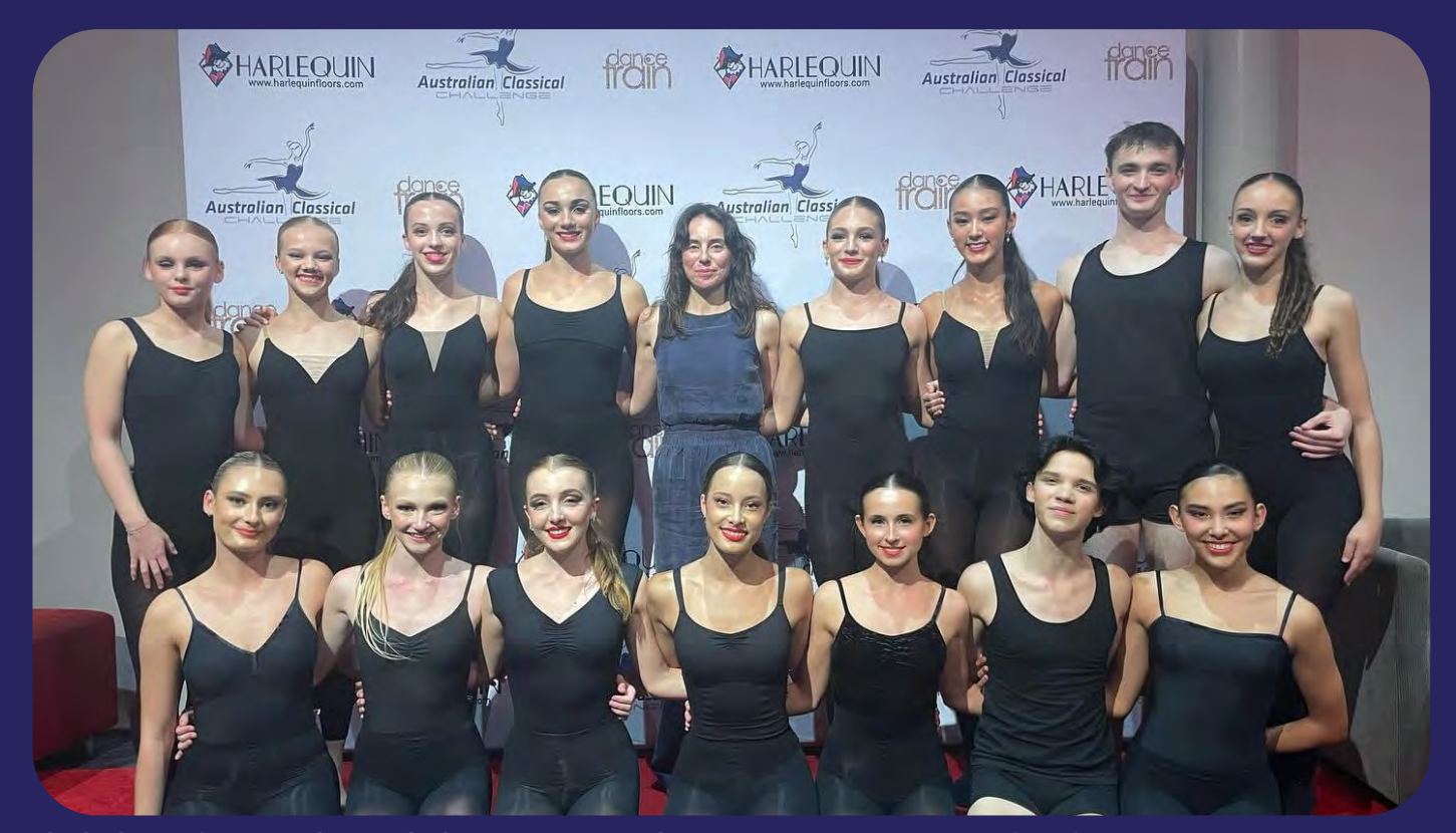
2024 SENIOR CONTEMPORARY FINALISTS