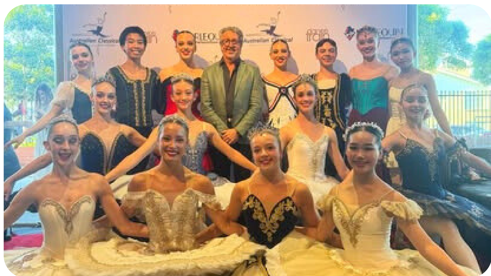
2025 SENIOR CLASSICAL FINALISTS NEWCASTLE EVENT