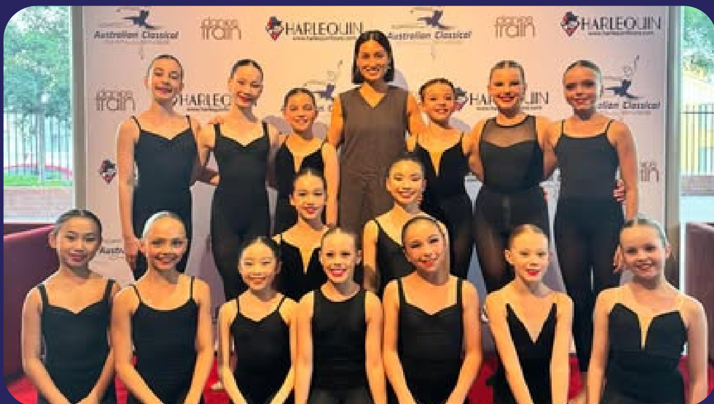
2025 JUNIOR CONTEMPORARY FINALISTS