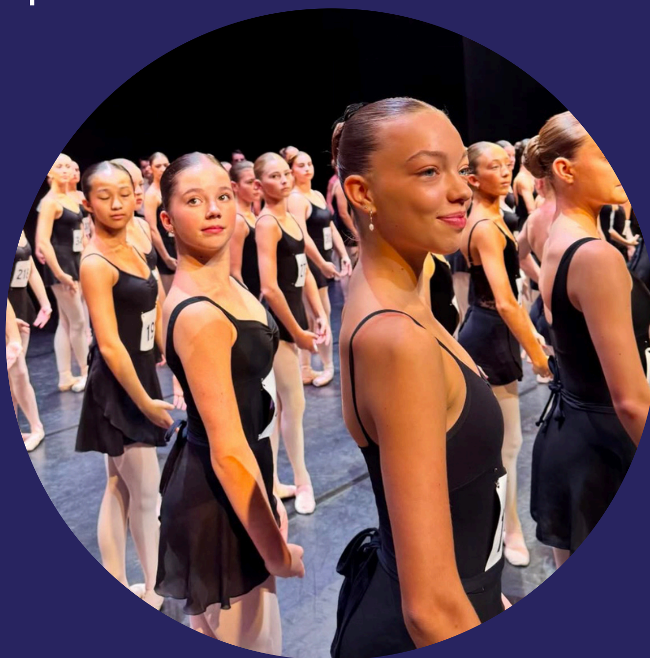
GRANDÉ DEFILE REHEARSAL 2025