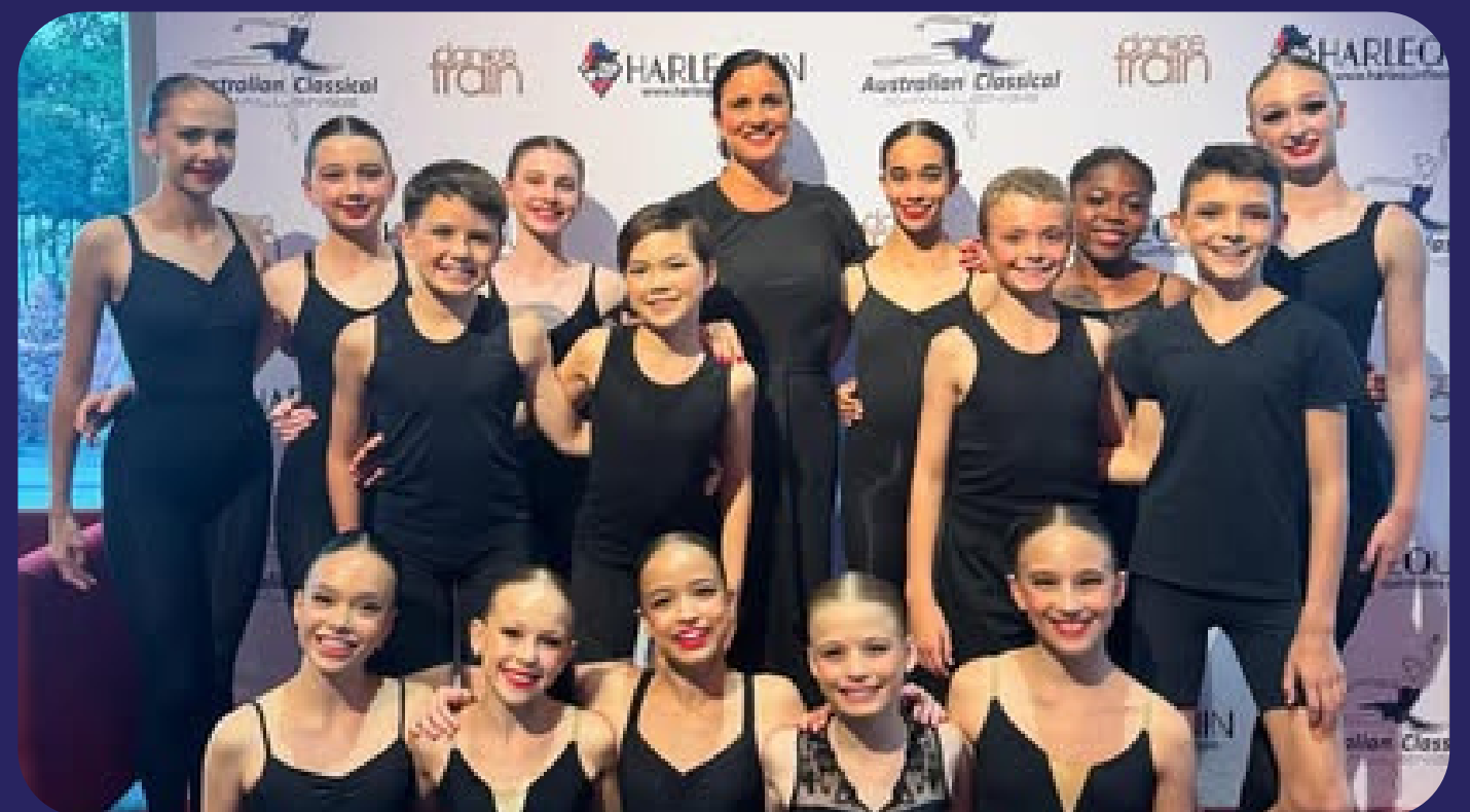
2025 PRE-INTERMEDIATE CONTEMPORARY FINALISTS