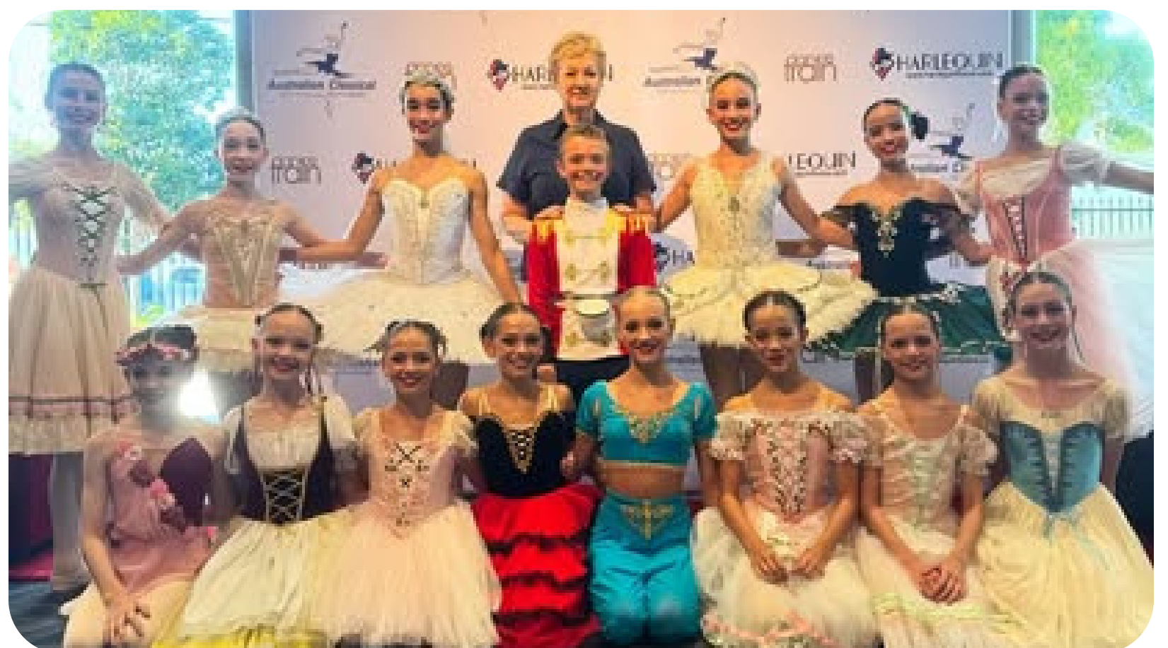
2025 PRE-INTERMEDIATE CLASSICAL FINALISTS NEWCASTLE EVENT