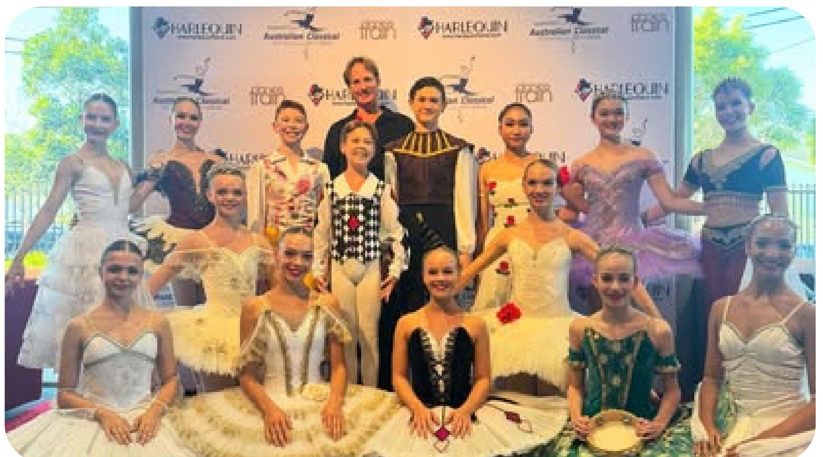
2025 INTERMEDIATE CLASSICAL FINALISTS NEWCASTLE EVENT