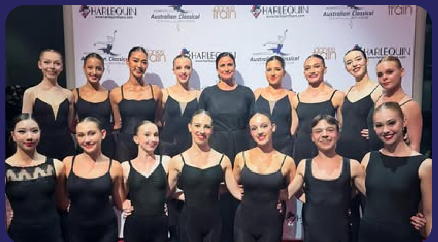
2025 SENIOR CONTEMPORARY FINALISTS