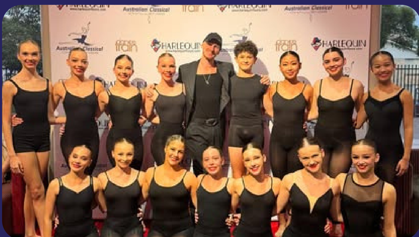
2025 INTERMEDIATE CONTEMPORARY FINALISTS