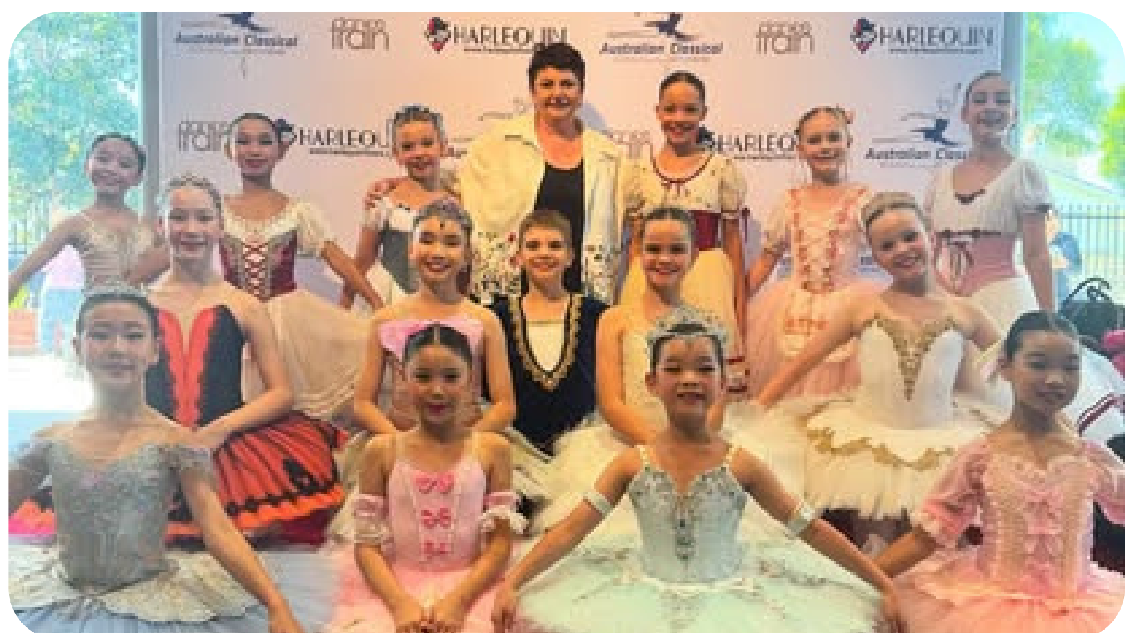
2025 JUNIOR CLASSICAL FINALISTS NEWCASTLE EVENT